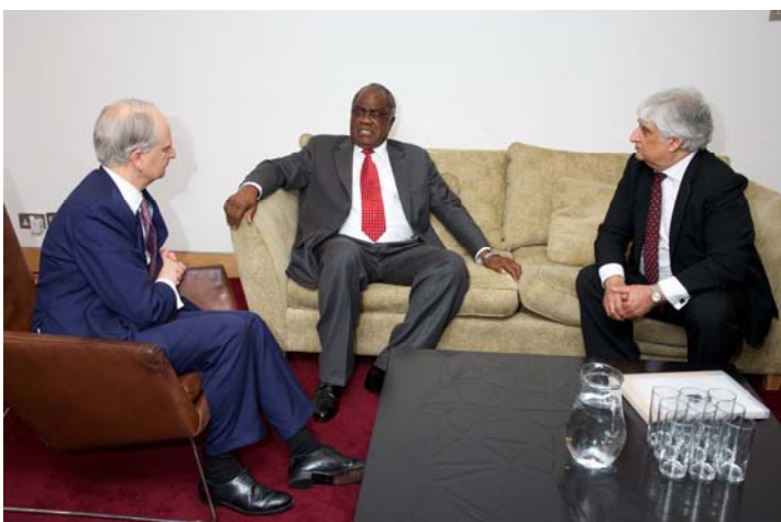
Pascal Dozie, Chairman, CBC and Hon. Dr. Hage Geingob, Minister for Trade and Industry, Republic of Namibia, ABF 2011, London UK